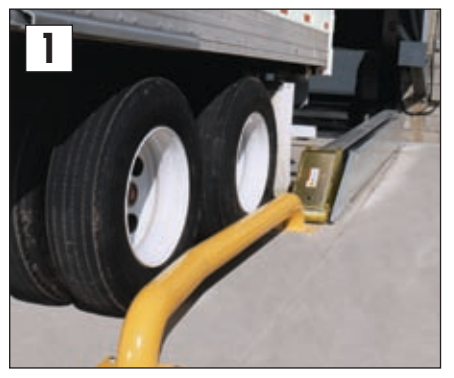
As the vehicle approaches the loading dock, it is guided into position between the wheel guides.