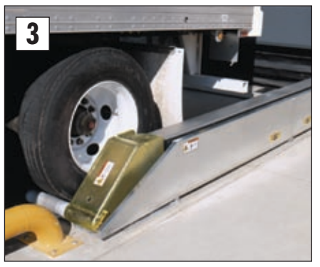
which then moves toward the loading dock using the energy of the trailer.