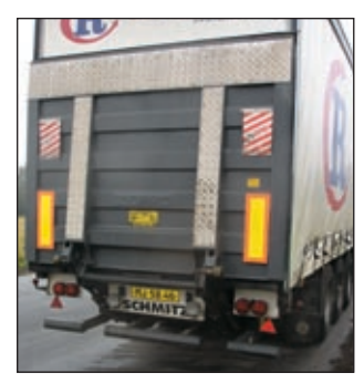
Restrain the widest variety of trailers, even those with hydraulic lift gates and folding gates.