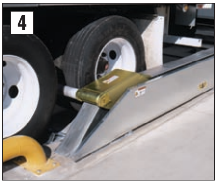
The locking arm automatically sizes the tyre and rises to its full height against the tyre.