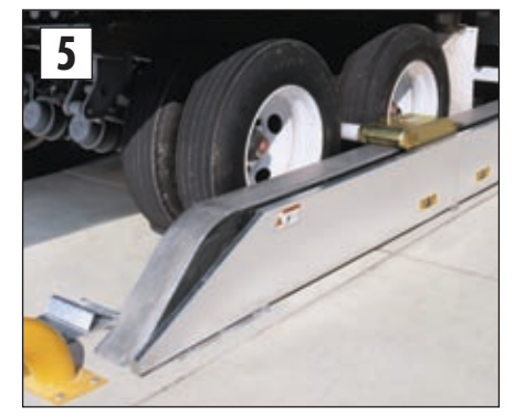
When the trailer is in the parked position...